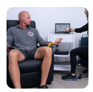
IDENTIFY NERVOUS SYSTEM DYSFUNCTION WITH HRV